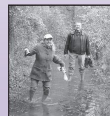
Wade for Life!