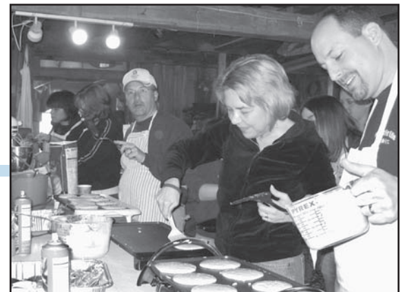
Board members, their spouses, and many other volunteers cooked hundreds of pancakes and sausages at our first Pancake Breakfast.