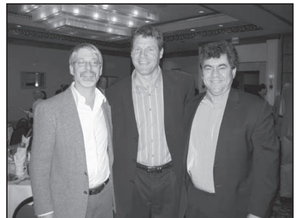
A great night of fellowship and celebration, as well as testimonies giving glory to our God.