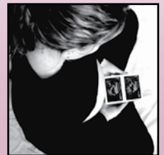
One Year of Ultrasounds